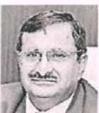
பெயர்: [Name of the person in the image]