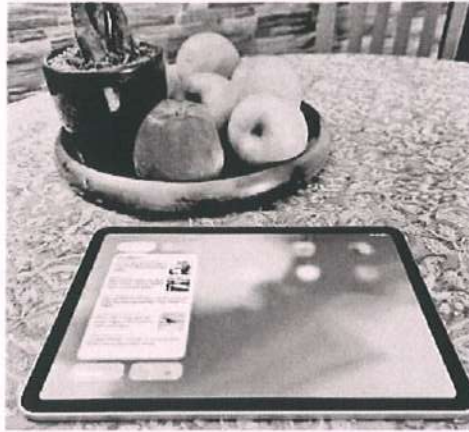
Perfect fit: The 10.9-inch iPad Air 2020 feels like it is just the right size

Cons: Too expensive, even more so with important accessories, should have moved on to AMOLED, and a high refresh rate for the screen, bezels could be thinner, battery life is just ok