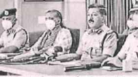
சென்னை யானைக்கால் சிவசாமி பள்ளி பகுதியில் மாமனார், மாமியார், கணவன் சுட்டுக் கொலை செய்யப்பட்டது குறித்து தலைமை அலுவலகம் வெளியிட்ட செய்தி.